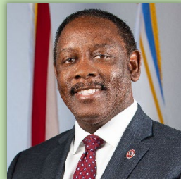
Orange County Mayor Jerry L. Demings